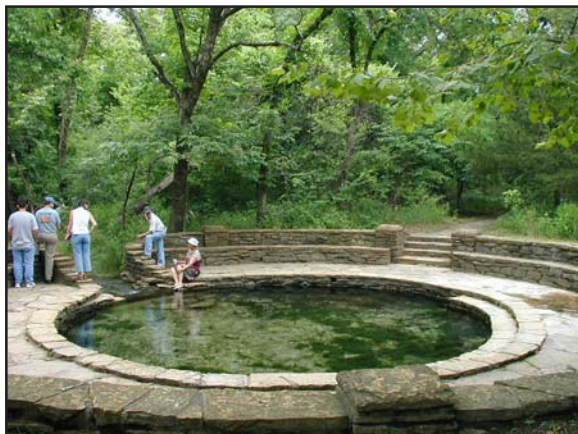
Buffalo Spring, part of the national park, is a freshwater spring originating from the Arbuckle-Simpson aquifer.

Understanding the hydrologic budget is important for managing and understanding the water resources of the Arbuckle Mountains. The U.S. Geological Survey developed a hydrologic budget of the Hunton Anticline region for a period of record in the 1970s. During this time, 80 percent of the average annual precipitation (38.4 inches) was returned to the atmosphere by evapotranspiration. The remaining 20 percent discharged from the area as surface runoff, of which 12 percent was base flow and 8 percent was direct runoff from land surface. Recharge to the aquifer was estimated from base flow to average 4.7 inches/year.