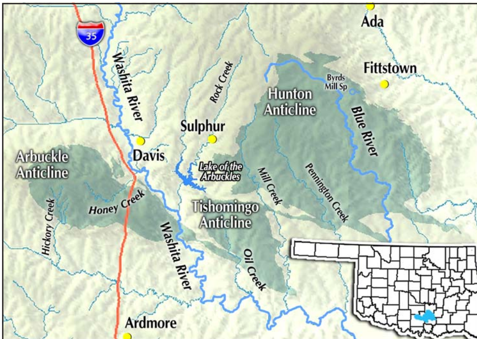
The general outcrop area of the Arbuckle-Simpson aquifer extends some 500 miles between Ada and Ardmore in south central Oklahoma.

Although Oklahoma water law considers groundwater the private property of the landowner, local residents, citizens' groups, and the National Park Service are concerned that large-scale withdrawals of water from the Arbuckle-Simpson aquifer will result in declining flow in streams and springs and cause groundwater levels to decline. As a result, the state will also investigate development of a management strategy that would protect the aquifer's current and future benefits yet comply with the basic precepts of Oklahoma water law.