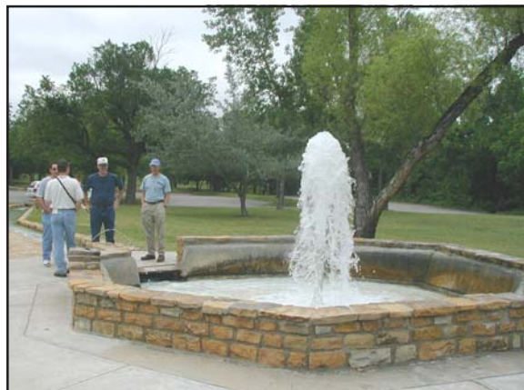
Vendome Well, an artesian well in the Chickasaw National Recreation Area

The Arbuckle-Simpson study will be coordinated by the OWRB, but will involve participation from dozens of agencies and organizations, as well as private citizens. A technical peer review team consisting of experts from the U.S. Geological Survey, Oklahoma Geological Survey, Oklahoma State University, and EPA will review the scope of work and provide advice to ensure the use of sound science and appropriate methods.