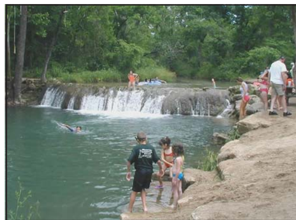
Springs from the Arbuckle-Simpson Aquifer provide base flow to Travertine Creek, a popular recreation spot in the Chickasaw National Recreation Area.