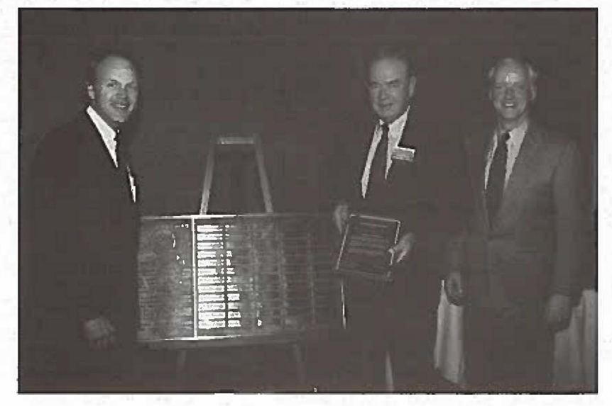
Senator Don Nickles and Governor Keating present Water Pioneer Award to Henry Bellmon, former U.S. Senator and Governor of Oklahoma.