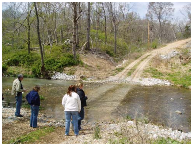
Low water crossing sediment control project at Demonstration Farm in Spavinaw Creek, part of Tulsa’s water supply basin.

Oklahoma’s CWSRF can fund virtually any pollution control project that is included in the NPS Management Program . Projects previously funded nationwide include: on-site sewage treatment, agriculture Best Management Practices (BMP’s), wetland protection/rehabilitation/construction, stormwater management, landfill leachate control,