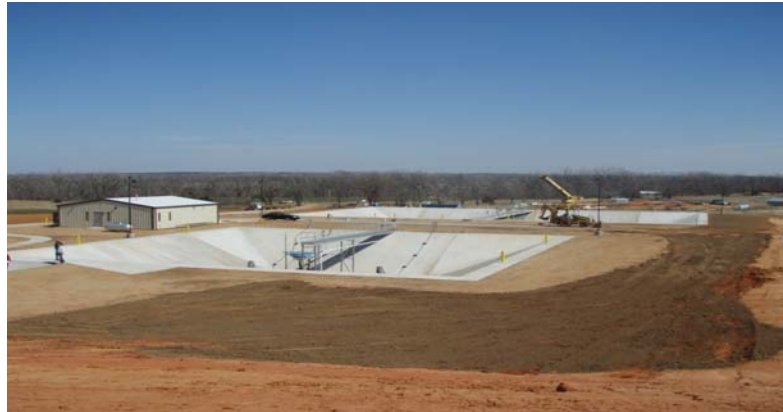
McLoud PWA New Sequencing Batch Reactor Facility financed by a $5,135,000 CWSRF Loan, McLoud, Oklahoma.

These four areas incorporate additional points if a project is located in a “Top Ten” priority watershed or in a watershed designated as a “high quality water,” for example. Rule changes to the Integrated Priority Ranking System may be considered during the FY 2009 rule cycle, if necessary.