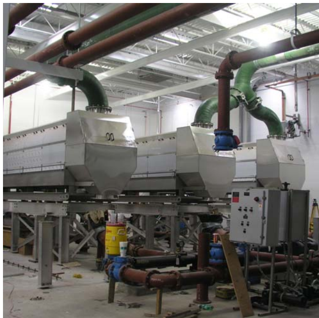
Tulsa’s Southside WWTP Sludge Thickening Units

Under State law eligible borrowers include any duly constituted and existing political subdivision of the State including counties, cities, towns municipalities, sewer districts, public trusts or authorities, and state agencies. Federal regulators also allow the program to provide third party loans to other borrowers through link deposit investments and pass-through loans with EPA approval. Other states are using this lending option to provide low-interest financing to farmers and homeowners who implement recognized best management practices to control nonpoint pollution threatening “Waters of the State.”