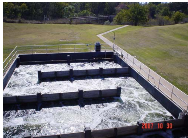
Ardmore Public Works Authority new chlorine contact basin

The Master Trust Agreement dated as of October 1, 2003, provides a bond structure that allows for cross-collateralization of the CWSRF and the DWSRF in order to provide additional bond security and ratings enhancement for both programs. With cross-collateralization, excess CWSRF revenues (revenues pledged to repayment of CWSRF bonds over and above what is needed to make actual debt service payments) would be available to cure any DWSRF bond payment default or reserve fund deficiency (Appendix C). Likewise, excess DWSRF revenues would be available to cure any CWSRF bond payment default or reserve fund deficiency. Pursuant to federal