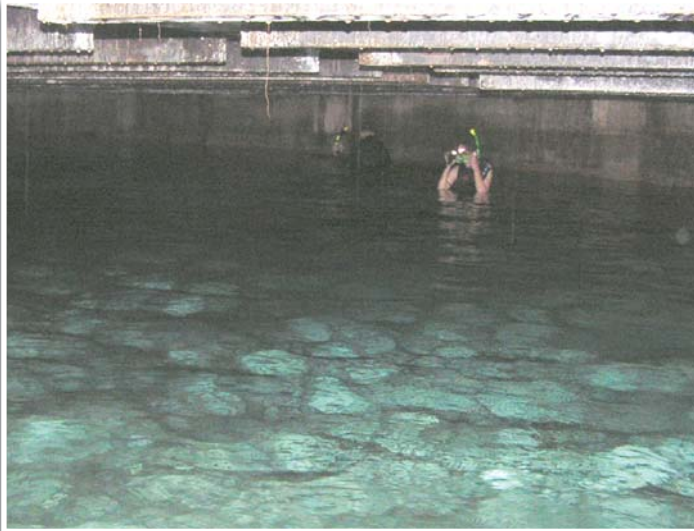
Noel Osborn taking a close look at the spring

concentration of 322 milligrams per liter (mg/L). The water is a calcium magnesium bicarbonate type, which is characteristic of Arbuckle-Simpson waters near Byrds Mill Spring.