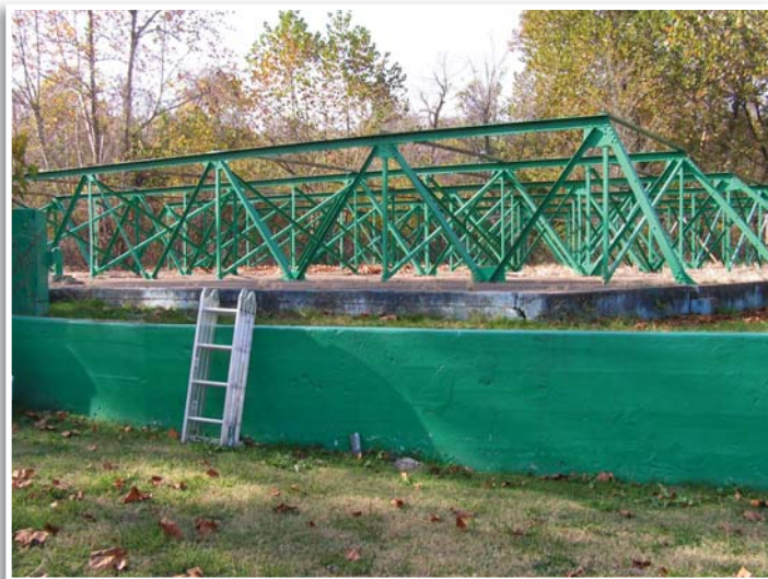
Cement enclosure and metal truss covering Byrds Mill Spring

If you visit Byrds Mill Spring today, you will not see a scenic bubbling oasis; rather, you will see water flowing from under a large cement structure topped with a metal truss. After purchasing the spring in 1910, Ada built a simple concrete wall