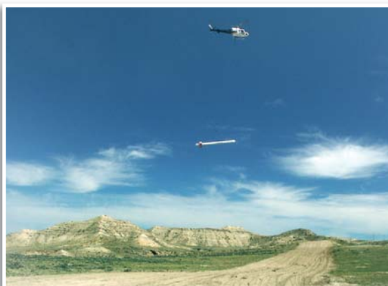
Helicopter and sensor during a previous study

Don't panic if you see a helicopter flying over the Arbuckle-Simpson aquifer region with a torpedo-like device dangling in the air. The helicopter and its cargo are just some of the tools being used to study the aquifer. The torpedo-like object is actually a sensor that sends out low-power electromagnetic waves that penetrate the earth and reflect off rocks to create a picture underneath the ground. Similar to a medical CAT scan, data obtained from the helicopter electromagnetic and magnetic (HEM) survey can be used to produce subsurface images of the electrical structure of the earth. According to Dr. Bruce Smith, a geophysicist with the U.S. Geological Survey, researchers can see much more detail of the earth's subsurface than ever before by using this technology.