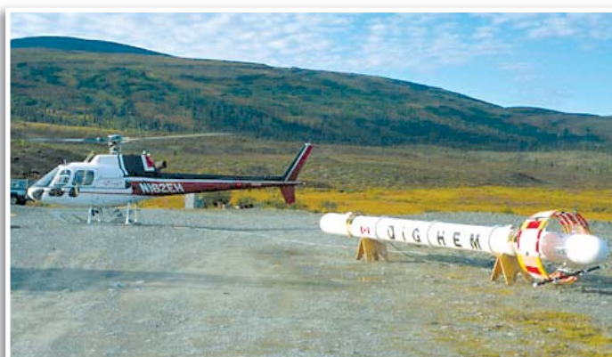
The helicopter and sensor prior to take-off

The study is being funded by USGS in cooperation with other state and federal agencies, such as the Oklahoma Corporation Commission, which is contributing additional funds to map possible underground salt-water contamination in nearby oil fields.