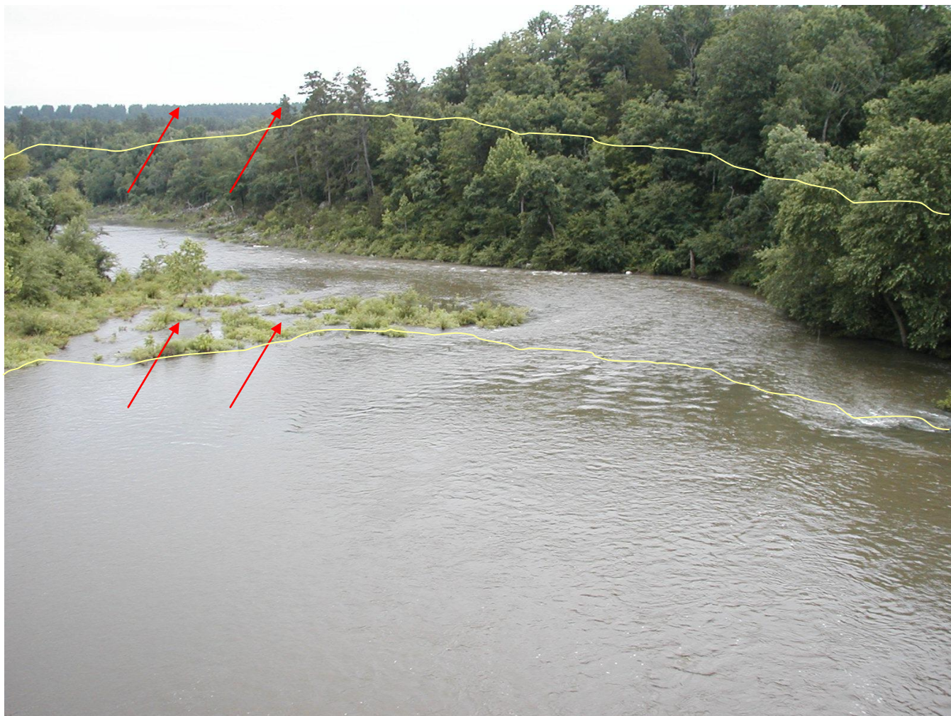
Figure 2. Medium Water Control

High Water Controls. The HWC governs the stage discharge relationship when the water extends past the MWC. The actual HWC is the floodplain of the waterbody.