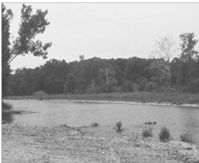
Barren Fork Creek, west of Westville, Oklahoma, just downstream of the intake for Adair County Rural Water District #5. The District's system serves some 1,000 customers through an allocation of 182 acre-feet of water from the OWRB.

The 50 cfs target flow was arrived at through results from a recent study, conducted by the OWRB and Oklahoma State University to quantify instream flow requirements, and input from the public and state environmental agencies. The new rule awaits approval by the State Legislature.