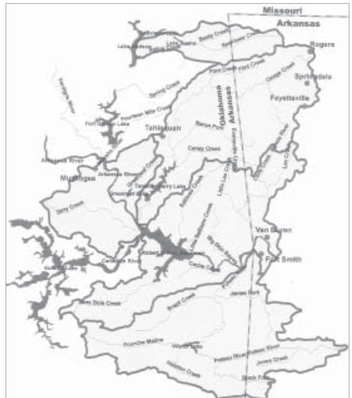
Arkansas-Oklahoma Arkansas River Compact area