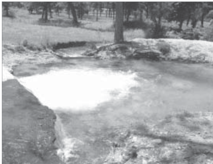
With recorded flows in excess of 20 million gallons of water per day, Byrd's Mill Spring has served as the primary water supply for the City of Ada for more than 90 years.

Many protestants of the groundwater use application had cited the presumed hydrologic connection between the aquifer and local springs, such as Byrd's Mill Spring.