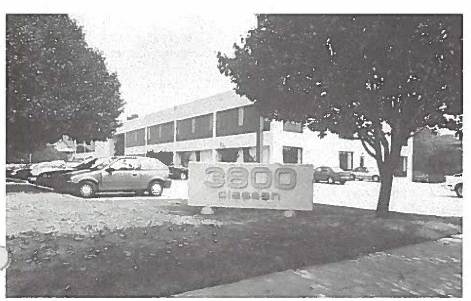
The Water Resources Board will occupy the concourse level and first floor of this building at 3800 Classen, with an expected move-in date of January 1, 1996.

The EPA recognized the bargain when it set in place the far-reaching Clean Water Act in the 1970's. Section 314 of the Act authorized the Clean Lakes Program and made grants available to states to identify pollution sources of publicly owned lakes and to restore and protect their recreational benefits. However, the