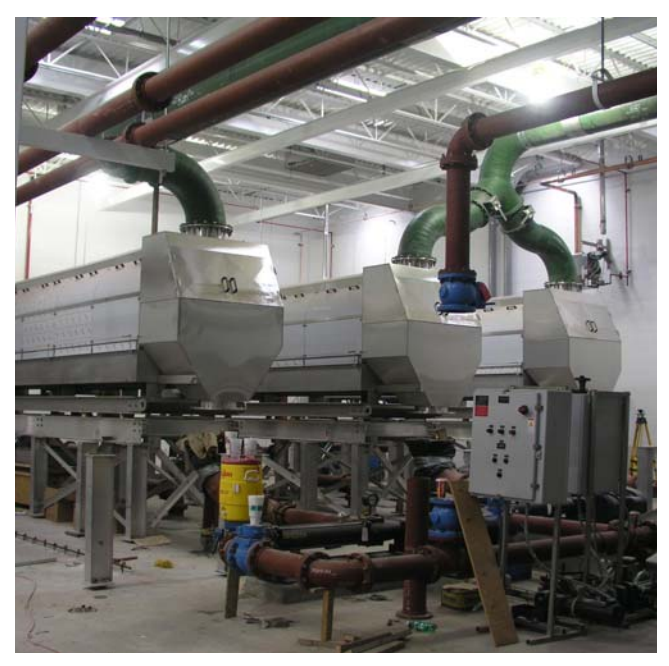
Tulsa's Southside WWTP Sludge Thickening Units

Under State law eligible borrowers include any duly constituted and existing political subdivision of the State including counties, cities, towns municipalities, sewer districts, public trusts or authorities, and state agencies. Federal regulators also allow the program to provide third party loans to other borrowers through link deposit investments and pass-through loans with EPA approval. Other states are using this lending option to provide low-interest financing to farmers and homeowners who implement recognized best management practices to control nonpoint pollution threatening "Waters of the State."