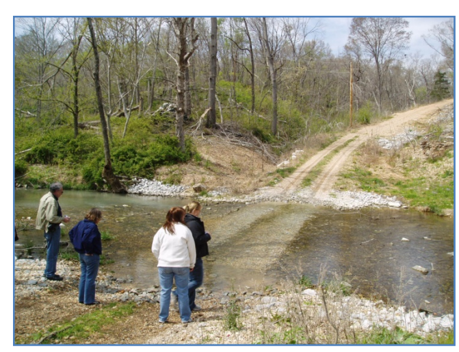
Low water crossing sediment control project at Demonstration Farm in Spavinaw Creek, part of Tulsa's water supply basin.

The Oklahoma Conservation Commission recently committed $3 million dollars from the $25 million Conservation Bond passed in the 2008 legislative session to match Federal Emergency Management Agency (FEMA) funds to repair flood damage to the conservation infrastructure in the Sugar Creek Watershed and to match United States Department of Agriculture (USDA) dollars for a Conservation Reserve Enhancement Program (CREP) initiative in the Sugar Creek Watershed and the Cobb Creek Watersheds. A portion of the funds will be used to purchase degraded stream buffer areas, which