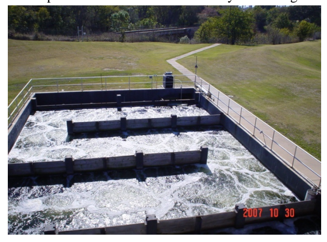
Ardmore Public Works Authority new chlorine contact basin.

enhancement for both programs. With crosscollateralization. excess CWSRF revenues (revenues pledged to repayment of CWSRF bonds over and above what is needed to make actual debt service payments) would be available to cure any DWSRF bond payment default or reserve fund deficiency (Appendix C). Likewise, excess DWSRF revenues would be available to cure any CWSRF bond payment default or reserve fund deficiency. Pursuant to federal regulations, collateralization support cannot extend to debt specifically issued for the purpose of providing state matching funds. The Master Trust Agreement provides adequate safeguards to ensure that future CWSRF or DWSRF bond issue will comply with this limitation.